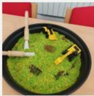
Cork City CC